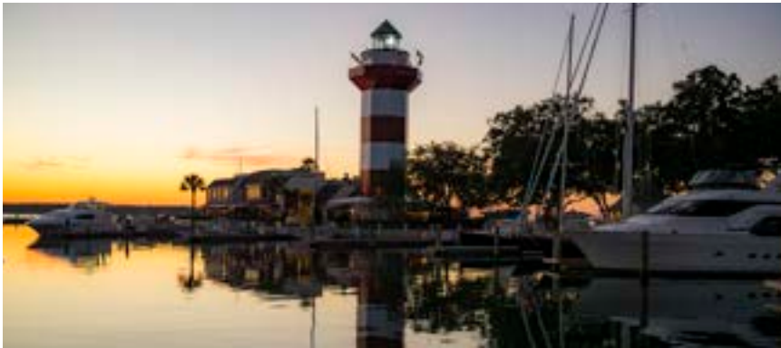
Harbour Town at Sea Pines