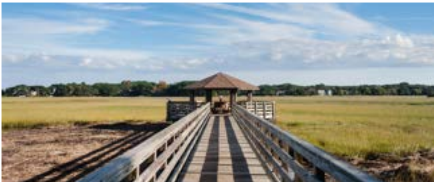
Mitchelville Freedom Park