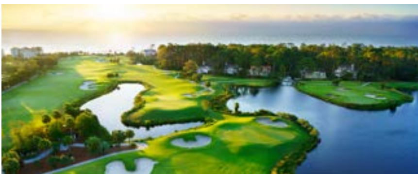
24 World Class Hilton Head Island Golf Courses